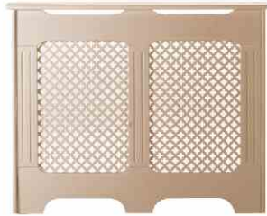
Small Radiator Cover RADC201