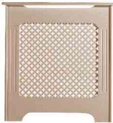
Mini Radiator Cover RADC200

Provides additional shelving space as well as a focal point. Enhance the appearance of old or unsightly radiators.