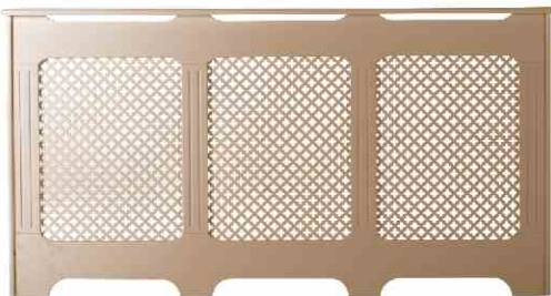
Large Radiator Cover RADC203