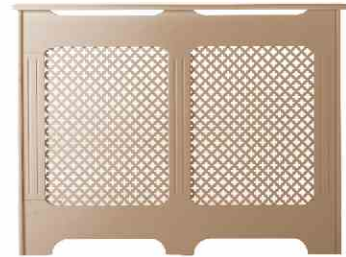
Medium Radiator Cover RADC202